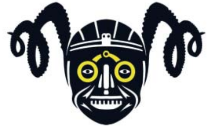
ROYAL ARMOURIES MUSEUM

Solution: The identity is based on a grotesque horned helmet, the remains of a suit of armour belonging to Henry VIII.